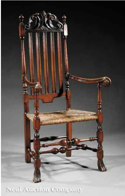
Neal Auction Company