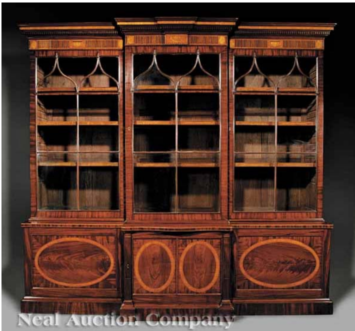
Neal Auction Company